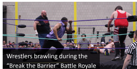
Wrestlers brawling during the "Break the Barrier" Battle Royale

What really made this event special was the spirit of inclusivity that was present throughout the night. People from different backgrounds came together to see the spectacle, sharing a rowdy night of thrills together. Thank you to everyone at Mega Championship Wrestling for putting together such a fun and exciting evening for a great cause!