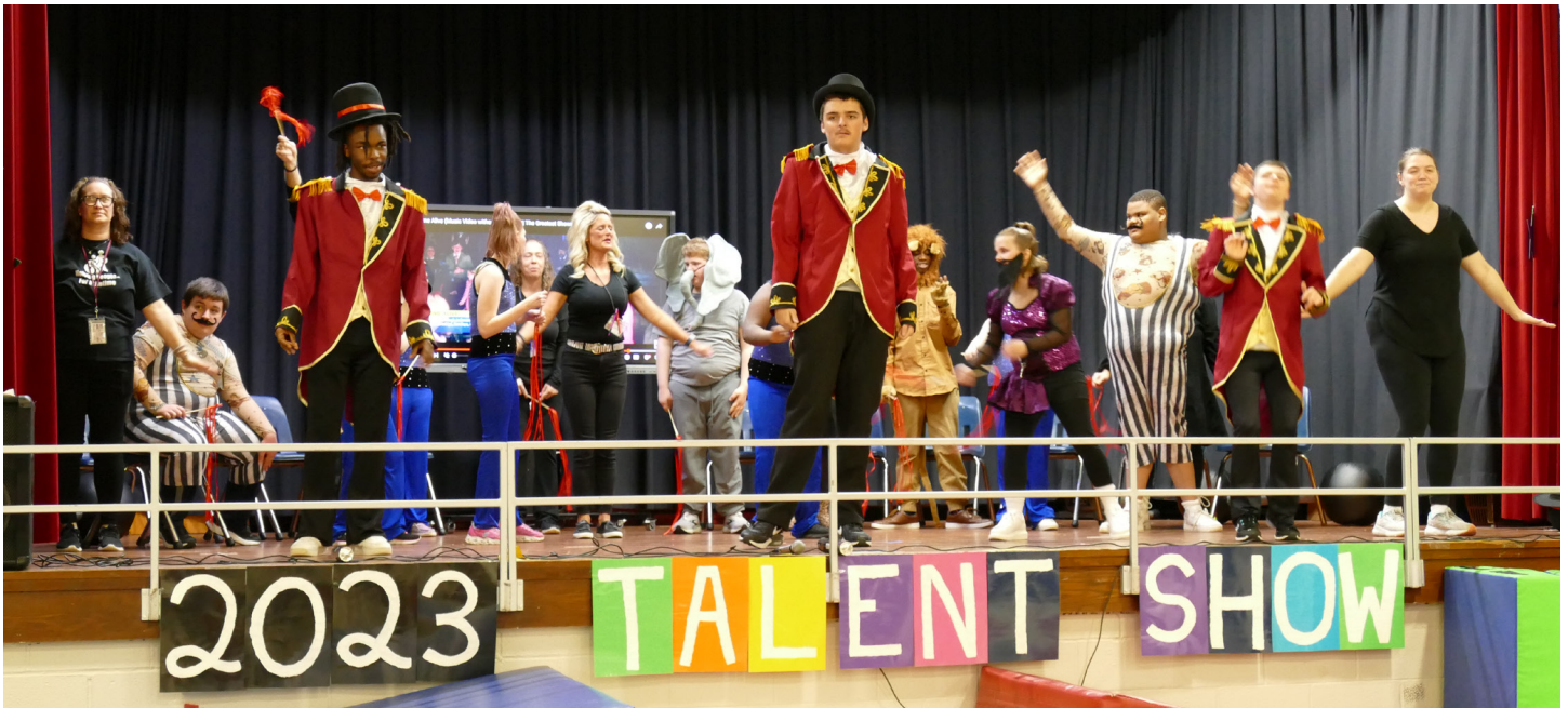
Students and staff performing the grand finale of the 2023 Talent Show