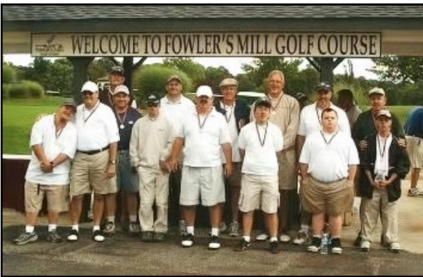
Pictured above: Members of the Murray Ridge Special Olympics Golf Team.

Members of the Murray Ridge Center Special Olympics Golf Team joined more than 100 golfers from Northeast Ohio recently to compete in the State Tournament held at Fowler's Mill Golf Club in Chesterland, Ohio. It was a beautiful, sunny day and golfers enjoyed a fierce competition, a delicious lunch and an award ceremony. When all was done, Murray Ridge golfers earned four gold, one silver, one bronze and one 4th place medal.