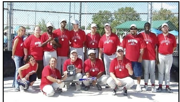
Pictured above: Members of the Murray Ridge Special Olympics Softball Team 1.

And while the gold team was putting its way to the golf championships, the Murray Ridge Raiders Softball Team 1 was battling its way to a different championship. After recently defeating Stark County in the Area Qualifiers, Murray Ridge Center Special Olympics Softball Team 1 advanced to the State Tournament in Oregon, Ohio. The Team was defeated in the first round by the highly-skilled Darke County Sluggers. However, the Team came back strong to defeat Darke County's second team, the Warriors, to earn the Bronze medal.