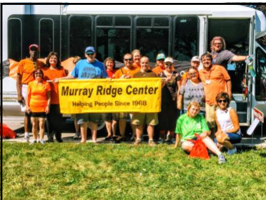
Murray Ridge Center October 2016

Murray Ridge Center said goodbye to summer 2017 on Sunday, September 24, as consumers, staff, family, and friends participated in the Woollybear Festival Parade in Vermilion!