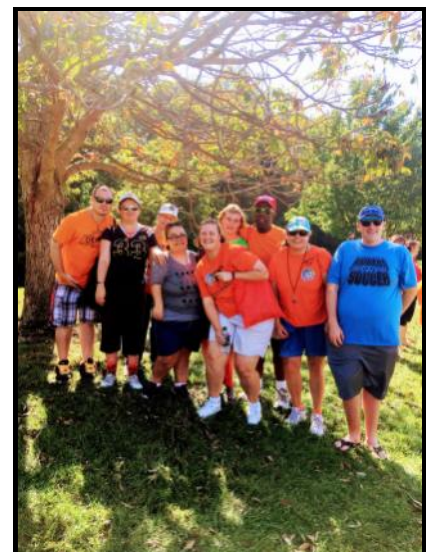
The Murray Ridge Courier

Thank you to all who helped make this another successful parade season!