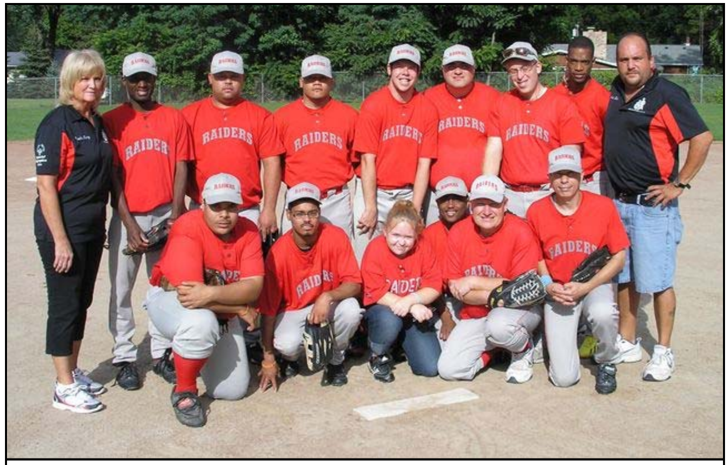
Above: The Murray Ridge Softball Team 1 at the State Softball Tournament on September 14, 2013. Below: The Murray Ridge Skills Team cheers after a very successful afternoon.

The Murray Ridge Raiders Softball Team 1 finished second place in Division 1 at the State Tournament in Oregon, Ohio on September 14, 2013.