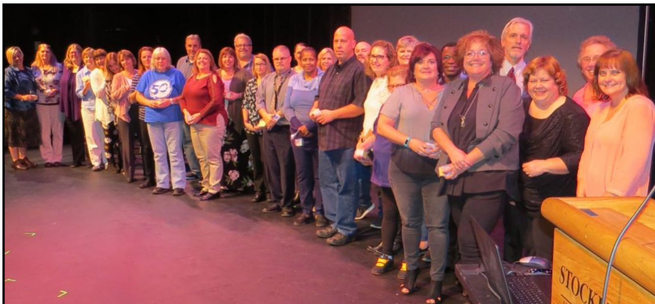
Above, 20 year award recipients smile with their supervisors.