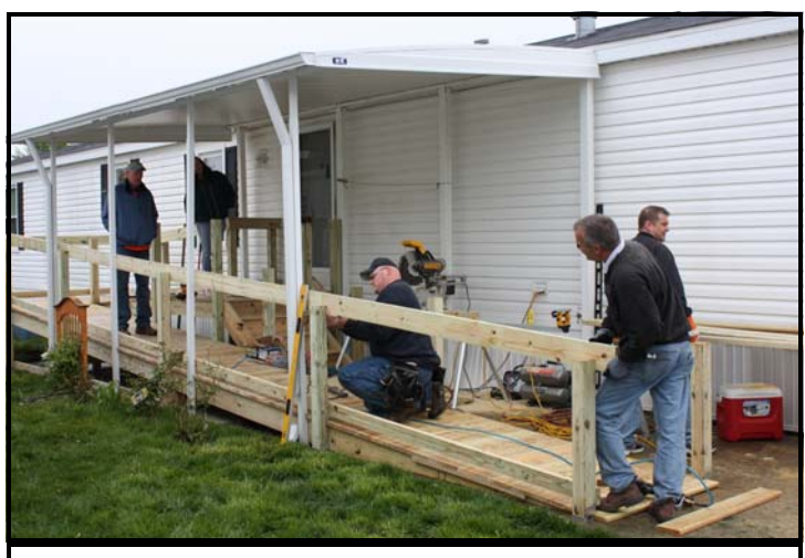
Volunteers work on constructing the new ramp.

Unfortunately, building a ramp proved to be more costly, with bids of almost $3,000. Finally, Val contacted friend and builder Brian Poyle who offered to help. Murray Ridge School then approached Home Depot of Lorain, who not only donated the remainder of the supplies not covered by Family Stability's $1,000, but also sent two volunteers to help build the new ramp.