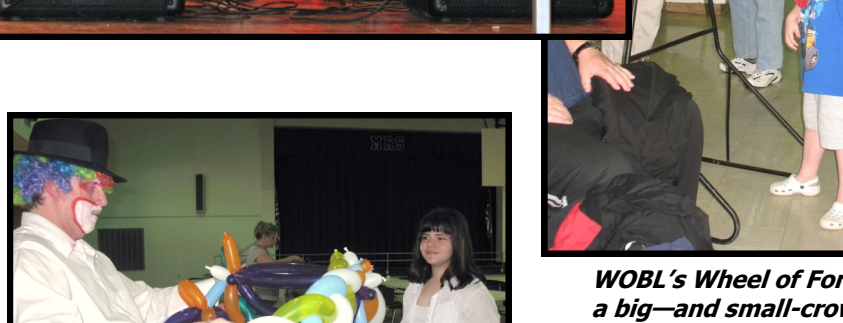
WOBL's Wheel of Fortune draws a big—and small-crowd.