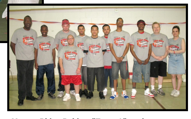
Murray Ridge Raiders "Team 1" made an appearance and was recognized for the recent state-level championship.