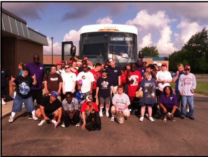
Athletes and staff prepare for the trip to Columbus.

Murray Ridge Center participated in the 2012 Special Olympics 43 rd Annual Ohio State Summer Games in Columbus. 46 Murray Ridge athletes competed in a variety of sporting events, including bocce, volleyball, tennis, track, and soccer.