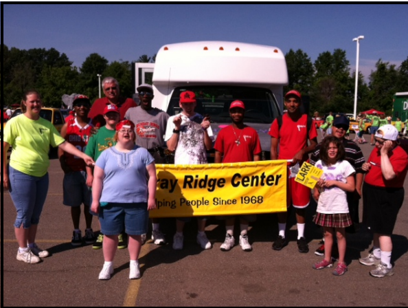
Participants from the LOVC, EOVC, and Murray Ridge School marched in the Avon Duct Tape Festival.