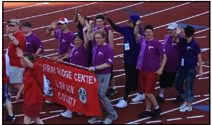
Athletes march in the Opening Ceremonies.

Murray Ridge proudly supports the Special Olympics throughout the year. Congratulations to the Murray Ridge athletes representing Lorain County this year at Ohio State Summer Games.