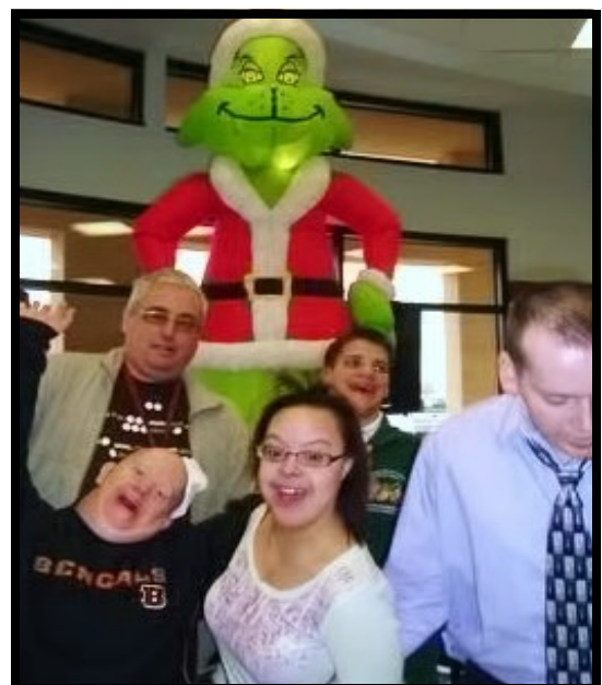
Consumers and staff at the Lorain Work/Activity Center welcome the holidays at the annual Christmas party.