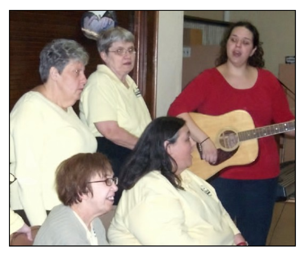
The Murray Ridge Choraleers perform for more than 300 people at the Lighthouse United Methodist Church.