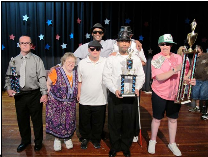
The winners! (above, l-r):