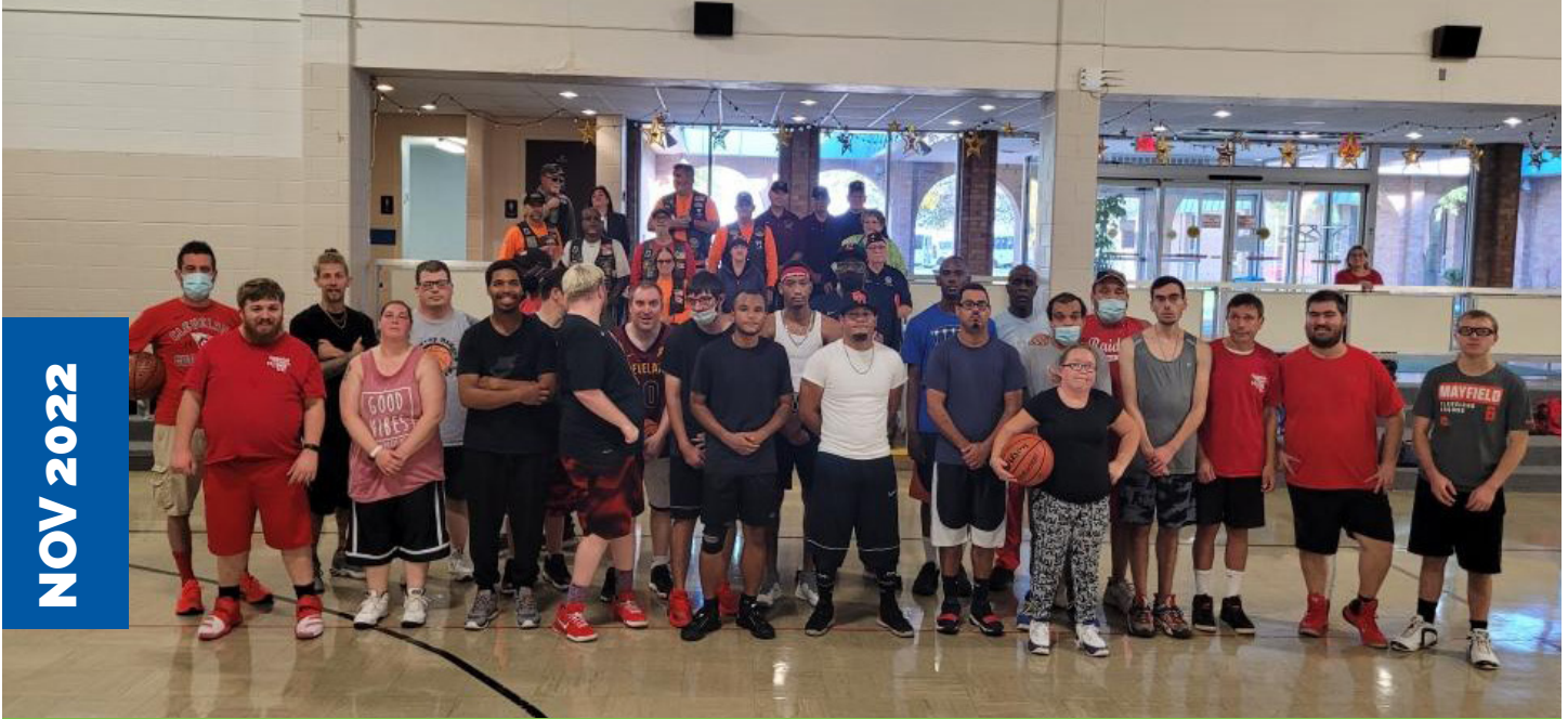
Members of Murray Ridge's Scarlet and Grey Basketball Teams with members of the Amherst American Legion