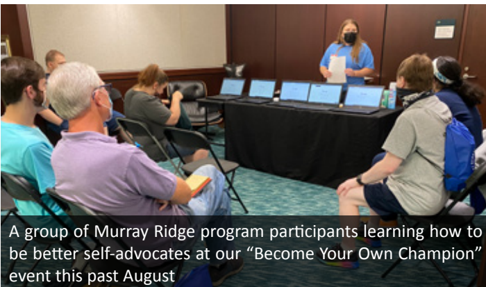
A group of Murray Ridge program participants learning how to be better self-advocates at our "Become Your Own Champion" event this past August