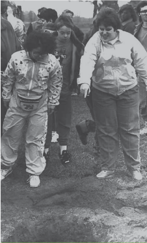
Murray Ridge School students at the time capsule's burying ceremony back in March of 1992