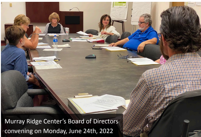
Murray Ridge Center's Board of Directors convening on Monday, June 24th, 2022