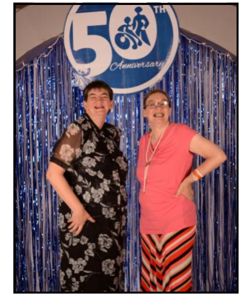
Murray Ridge Center