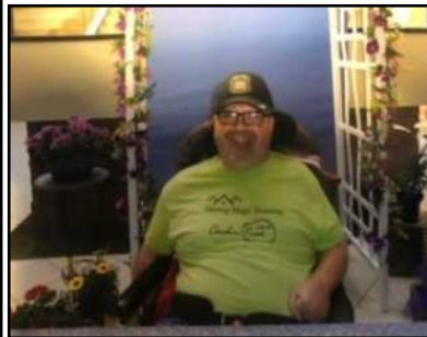
Enjoying flowers at REM.