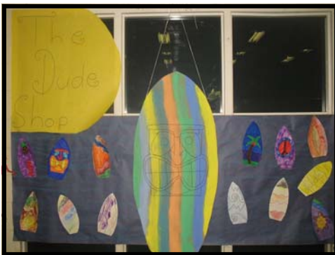
Area 4 won the surfboard decorating contest with its big board surrounded by little boards.