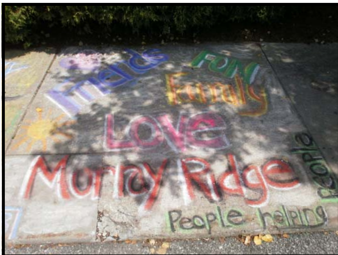
Murray Ridge Center July 2011