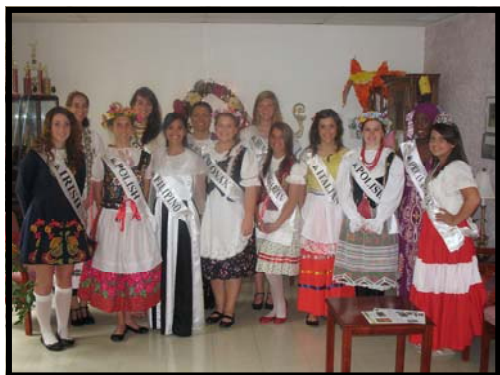
The 2011 Lorain International Association Princess Pageant contestants.

This year, the princesses were treated to a tour of the Elyria facility, a meet and greet with Murray Ridge consumers, and an impromptu dance and photo session. In anticipation of the princesses' visit, Murray Ridge Center consumers decorated the Work/Activity Center with maps, flags, and other cultural items representing various countries around the world.