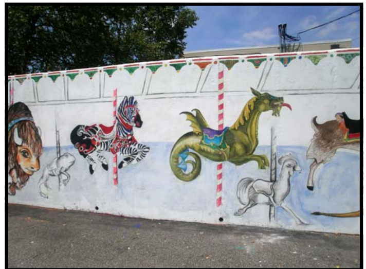
The Murray Ridge Courier